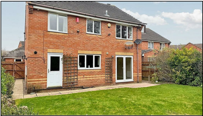
Warren House Walk, Sutton Coldfield, B76 1TS